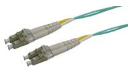
LC to LC Patch Lead