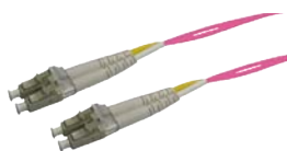
LC to LC Patch Lead