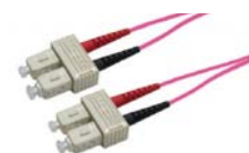
SC to SC Patch Lead

■ OM4 PATCH LEADS AVAILABLE ON REQUEST IN OTHER CONNECTOR COMBINATIONS AND LENGTHS