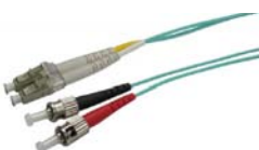
LC to ST Patch Lead