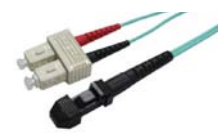
SC to Mt Patch Lead

■ CUSTOM FIBRE LEADS AVAILABLE ON REQUEST IN A WIDE RANGE OF CONNECTORS AND LENGTHS