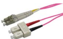
LC to SC Patch Lead