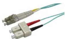
LC to SC Patch Lead